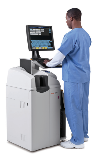
Ideal for use with CARESTREAM DIRECTVIEW CR Systems

The DRYVIEW 5950 Laser Imager is part of the industry's most complete diagnostic imaging portfolio. Carestream offers solutions for the entire imaging chain, including Computed Radiography (CR), Digital Radiography (DR), HIS/RIS, PACS, hardcopy digital output and traditional film and screen products. Choosing Carestream as your imaging partner makes it easy and affordable to meet your current needs and build for your future.